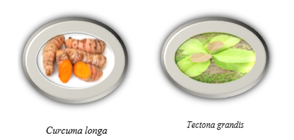
Figure 1: Curcuma longa rhizome and Tectona grandis leaves