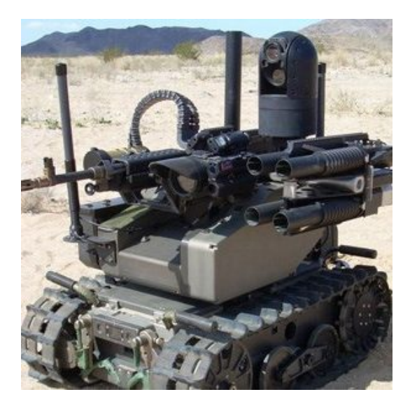
Figure 3: MAARS - Modular Advanced Armed Robotic System.

Another researcher embraces the view that it is imperative to immediately criminalize any research in AI weapons, and the crossbreeding of humans with machines, considering these as crimes against humanity; in order to avoid the likelihood where the other half of myself will be my robot [32].